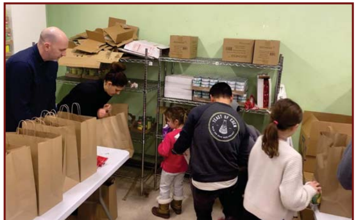
Members of St. Ignatius Serving at Catholic Charities of Boston—Yawkey Center Food Pantry, Dorchester

"Love consists in visible acts that bespeak a shared divine parentage and a common commitment to one another."