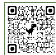
Plataforma de Accion